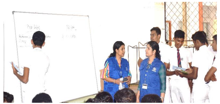
Figure 3 - Career Guidance activities involving students in Batticaloa

Significantly, the Batticaloa Career Guidance school student's workshop included 73 students who look forward to face the Advanced level examination end of this year representing the age group of 17-18 years. As the students belong to Generation Z, the workshop training strategy was changed to capture their attention.