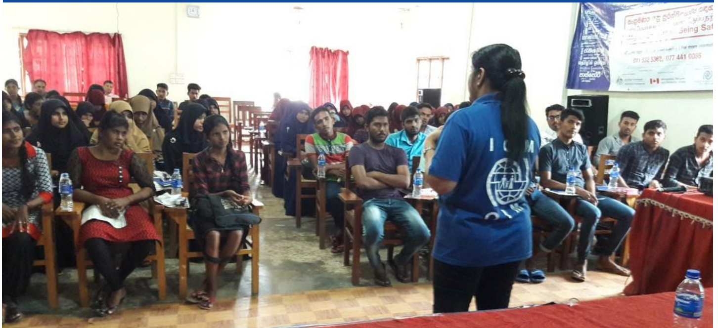
Figure 1 – The safe and regular migration based career guidance session conducted for unemployed youth in Trincomalee District

International Organization for Migration (IOM) The UN Migration Agency